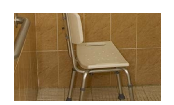
Home Safety and Alzheimer's Disease